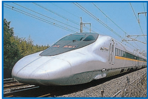
Sanyo Shinkansen "HIKARI Rail Star" Sanyo Shinkansen (622.3 km) Train Names: NOZOMI, HIKARI (incl. HIKARI Rail Star), KODAMA