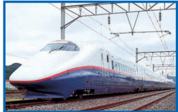
Nagano Shinkansen "ASAMA" Nagano Shinkansen (222.4 km) Train Name: ASAMA