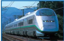
Yamagata Shinkansen "TSUBASA" Yamagata Shinkansen (421.4 km) Train Name: TSUBASA