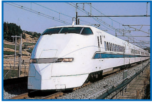
Tokaido & Sanyo Shinkansen "HIKARI" Tokaido Shinkansen (552.6 km) Train Names: NOZOMI, HIKARI, KODAMA (Tokyo thru Hakata, 1,174.9km)