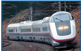
Akita Shinkansen (662.6 km) Train Name: KOMACHI