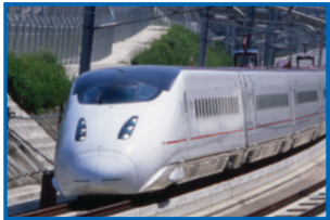
Kyushu Shinkansen "TSUBAME"

Note : There are three types of train services, "NOZOMI," "HIKARI" and "KODAMA" on the Tokaido and Sanyo Shinkansen, and the stations at which trains stop vary with train types. The JAPAN RAIL PASS is only valid for "HIKARI" and "KODAMA" trains, and not valid for any seats, reserved or non-reserved, on "NOZOMI" trains. To travel on the Tokaido and Sanyo Shinkansen, the pass holders must take "HIKARI" or "KODAMA" trains, or pay the basic fare and the Shinkansen express charge to take "NOZOMI" trains. (See p. 5 for detail)